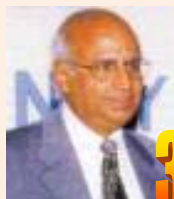
S. Ramadorarai, TCS