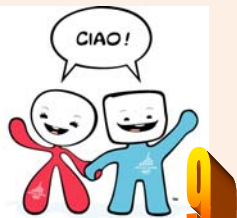
Olympic mascots of Torino 2006 Neve and Gliz