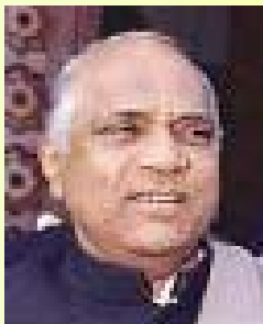
Pawar Elected BCCI President