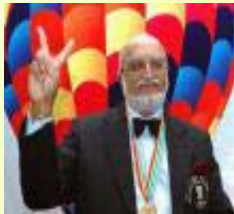
Tycoon ‘Pierces’ Sky to Set World Record