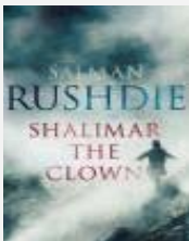
Special Feature: Shalimar the Clown Page 10