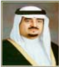
King Fahd Passes away Page 2