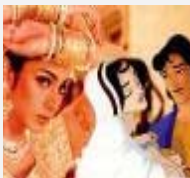
Bhagmati set for release Page 9